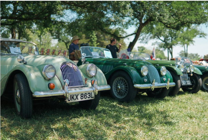
The Morgan Class at All British & European Car Day 2025