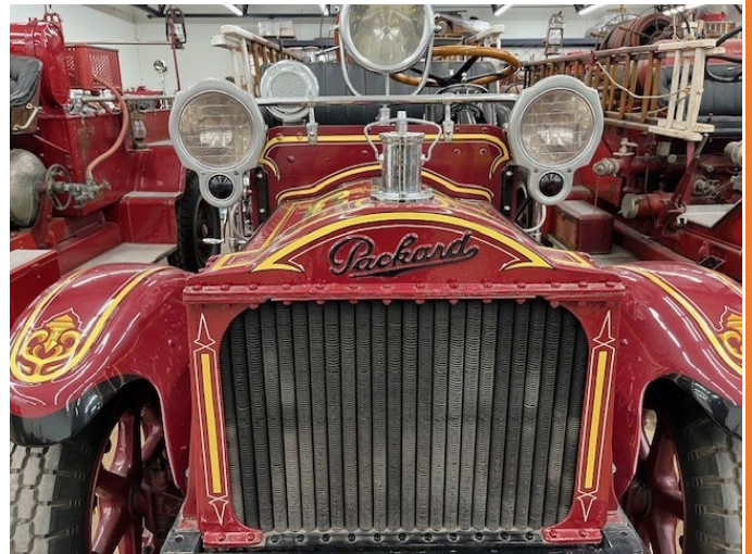
I didn't know Packard made fire trucks back in the day, did you?