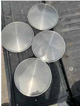
4 Moon Dish Wheel Covers for 14" Wheels. $50

Also a radiator from a 1959 Ford Fairlane (fits many Fords). It has a modern core and does not leak. $150