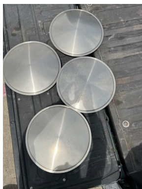
4 Moon Dish Wheel Covers for 14" Wheels. $50

Also a radiator from a 1959 Ford Fairlane (fits many Fords). It has a modern core and does not leak. $150