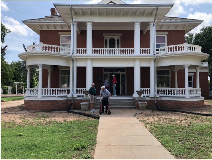
The Frank Kell Mansion