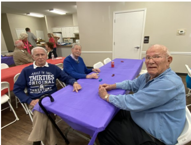
Love the T-Shirt !