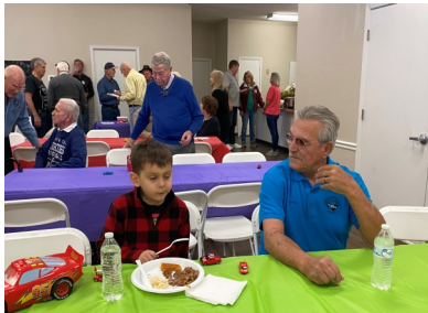
Say What ??