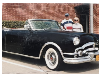
1953 Packard Caribbean one of only 750 produced