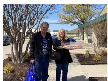
80 and still going strong