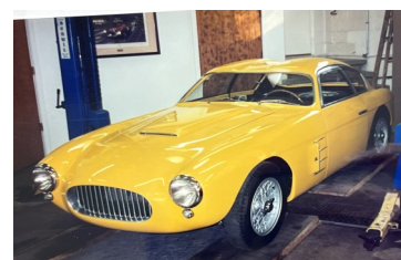
1953 Fiat 8V

one of only 3 ever produced with the double bubble top