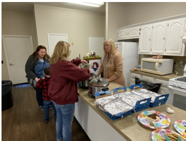
There was a LOT of delicious Brisket !