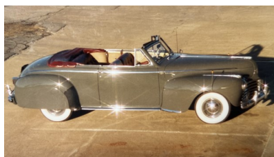
1941 Chrysler Convertible