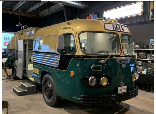
1949 Communications "van" A wonderful restoration.