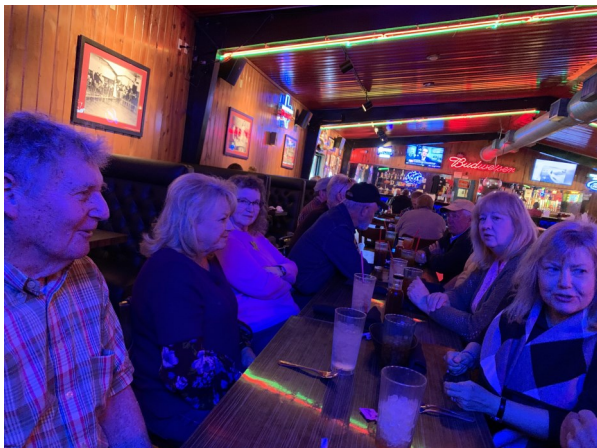
Lunch at the Country Tavern, just west of Kilgore