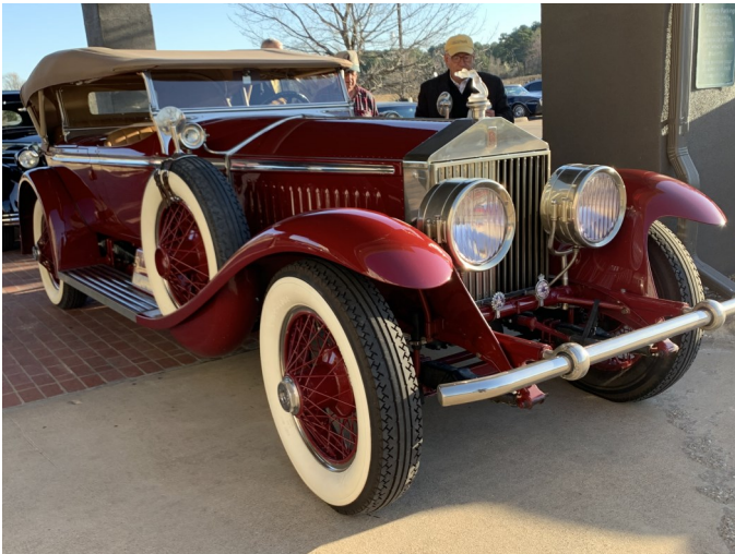
1925 Rolls Royce—John Wampler

Happiness is driving on an East Texas back road on a Spring morning and looking into your rear view mirror and seeing a string of Classic cars trailing behind. Gathering in Terrell, Texas, our group headed for our first stop, Athens, Texas. Being a bit hungry, we dropped into Danny's Bar Be Que for lunch. Refreshed with our meal, the group proceeded to the Texas Fresh Water Fish Center. The Center, operated by the Texas Wildlife Department, is a complex of walking trails, fish exhibits and a small fishing pond/park. Leaving the Center, more back roads that lead to Lindale, Texas for our overnight stop. In Lindale, we shared our evening meal at the Italian Garden, a local restaurant.