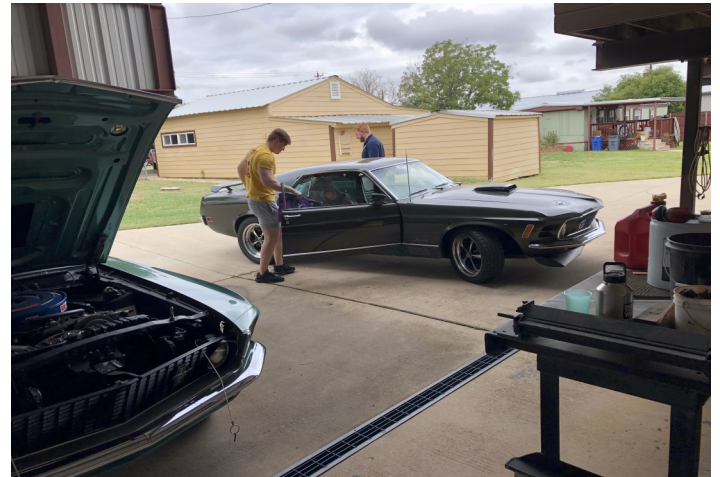
Phillip's Mach 1