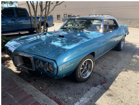
Cole &amp; Kathy—1969 Firebird 400