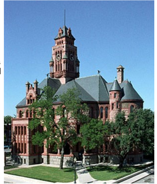
Ellis County Courthouse in Waxahachie, TX