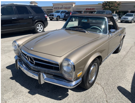
Ira &amp; Nuris—1971 Mercedes 280SL