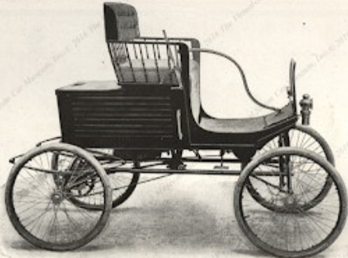
The Stanley Stanhope Model, No. 1