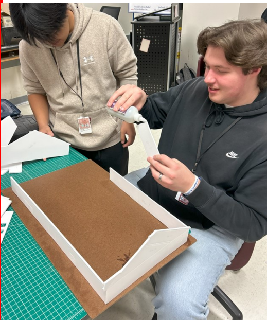
K and Z work on their architectural model after cutting out all the vellum paper patterns.

If you would have told me in grad school (civil engineering) that I would walk away from field engineering work to teach mechanical engineering principles I would not have believed you! These little spurts of student achievement really make it worth it. The kids are excited for a free day off from school but I'm excited to see them show off their best work against their peers.