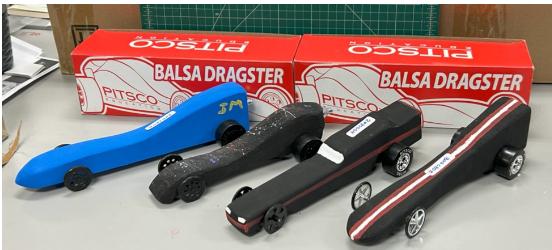
Cars lined up and ready to GO!!

Earlier last semester, I decided to start a chapter of Technology Student Association which I had championed previously as an adviser. Starting a new engineering focused chapter has its own challenges, so I picked a project where I had amazing success previously with students competing at the national level. I decided to focus on the CO2 dragster and custom hot rod designs.