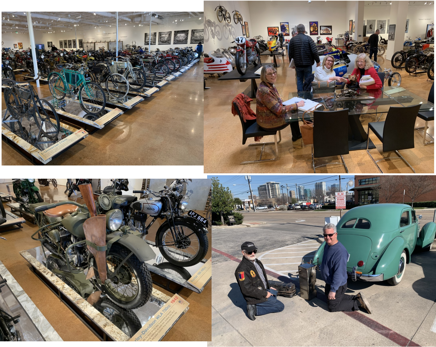
It's great to see all the "willingness to help" in our club

However, the drawback to this wonderful place was lack of meeting space. We ended up meeting in a makeshift, half outdoor sort of a room that led to poor acoustics and many of us struggling to hear the topics that leadership had on the agenda. Consequently, we have several items from the agenda either under addressed, not correctly heard or not addressed at all. We need to make sure that our future venues allow for meeting spaces that yield opportunities for our club to be able to clearly discuss and decide on the issues at hand.