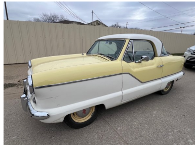
The Little Car that Could