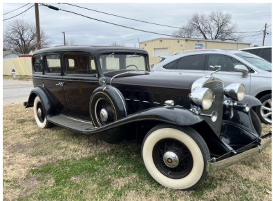
Well, not far to drive...