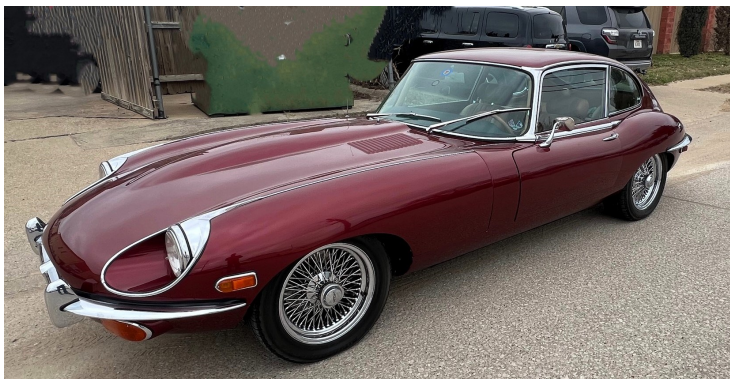
Ain't She a Beaut ?!