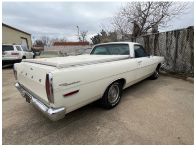
This car can go anywhere!!

Look who braved the cold and forecasted rain??